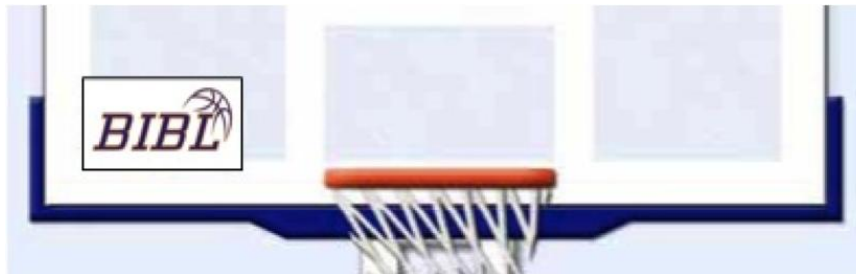
Diagram – Backboard BIBL logo

7.2.10. The BIBL logo must appear on the lower left corner in both backboards [dimensions: 25cm (length) x 15 cm (height)], as presented in the diagram below.